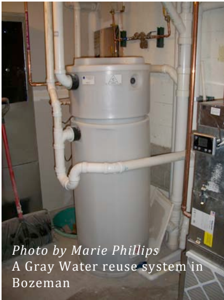
A Gray Water reuse system in Bozeman

In the average Montana household, each person uses approximately 100 gallons of water per day (American Water Works Association). More than twenty percent of this can be avoided by reusing water for flushing toilets (BRAC Systems). Making a house ready for gray water reuse requires keeping the piping separate for gray water sources. It costs about $500 dollars (plumber’s estimate) per bathroom to install this type of dual plumbing in a household. Even if a full-flung gray water reuse system is not installed, it would still be relatively inexpensive to install dual plumbing in all new construction projects so they are all “gray water ready.” The policies and rules on gray water are relatively new to Montana, it’s workforce, and it’s regulators. As more systems are installed, permitted, and used, Montanans become more familiarized with the technicalities of these systems and better able to incorporate them into the greater context of water conservation.