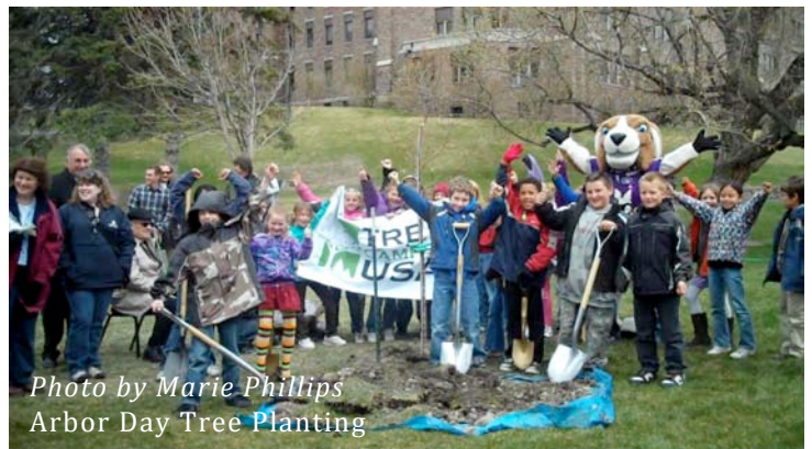
Arbor Day Tree Planting

On April 29 th , Arbor Day was celebrated at Carroll College with the announcement of Carroll as the first campus in Montana to become a Tree USA campus for their commitment to urban forestry. Students from Broadwater Elementary participated in a poster contest for the event and helped plant a new tree on campus, with Carroll mascot, "Halo."