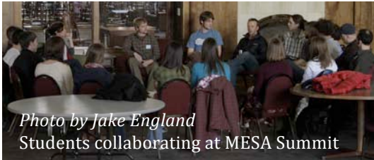
Students collaborating at MESA Summit

Conference attendees had the opportunity to interact with policy-makers from each side of the aisle, starting with an opening keynote presentation by Republican