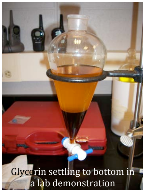
Glycerin settling to bottom in a lab demonstration

Meanwhile the methanol and lye are mixed to create methoxide. Once the oil is heated the methoxide mixture is added. Over the course of the reaction, glycerin (a common ingredient in moisturizers or soaps) settles to the bottom and is then filtered off. The remaining crude biodiesel still contains some impurities that are